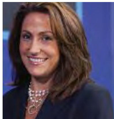
▲ Mylan President Heather Bresch.

The company's goal is to become the world's most efficient generics and specialty pharmaceutical company, allowing it to provide affordable medications to more people in more places than ever before. Because at Mylan, anything less isn't good enough.